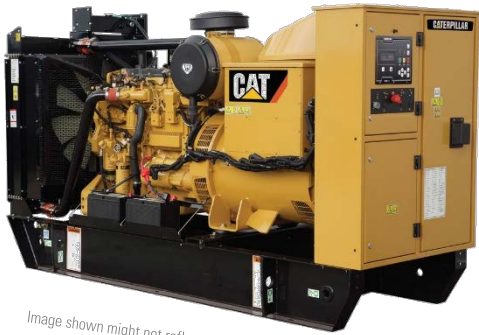
Image shown might not reflect actual configuration