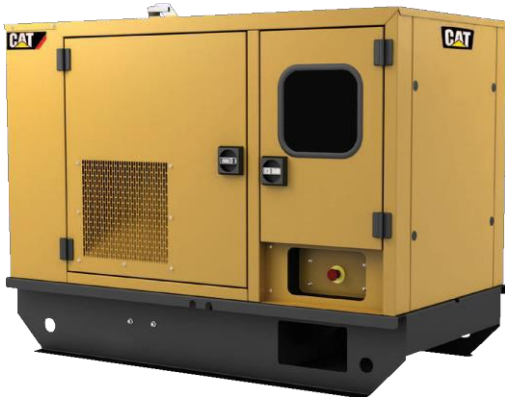
Enclosure pictured may include optional accessories