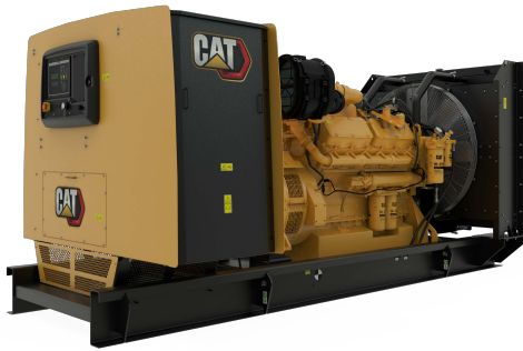
Image shown may not reflect actual configuration